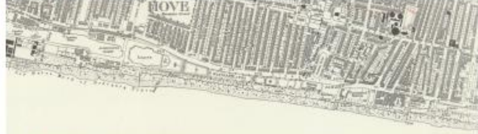
Inacresottie geriene (Sunken Gerden beside Rockweter)